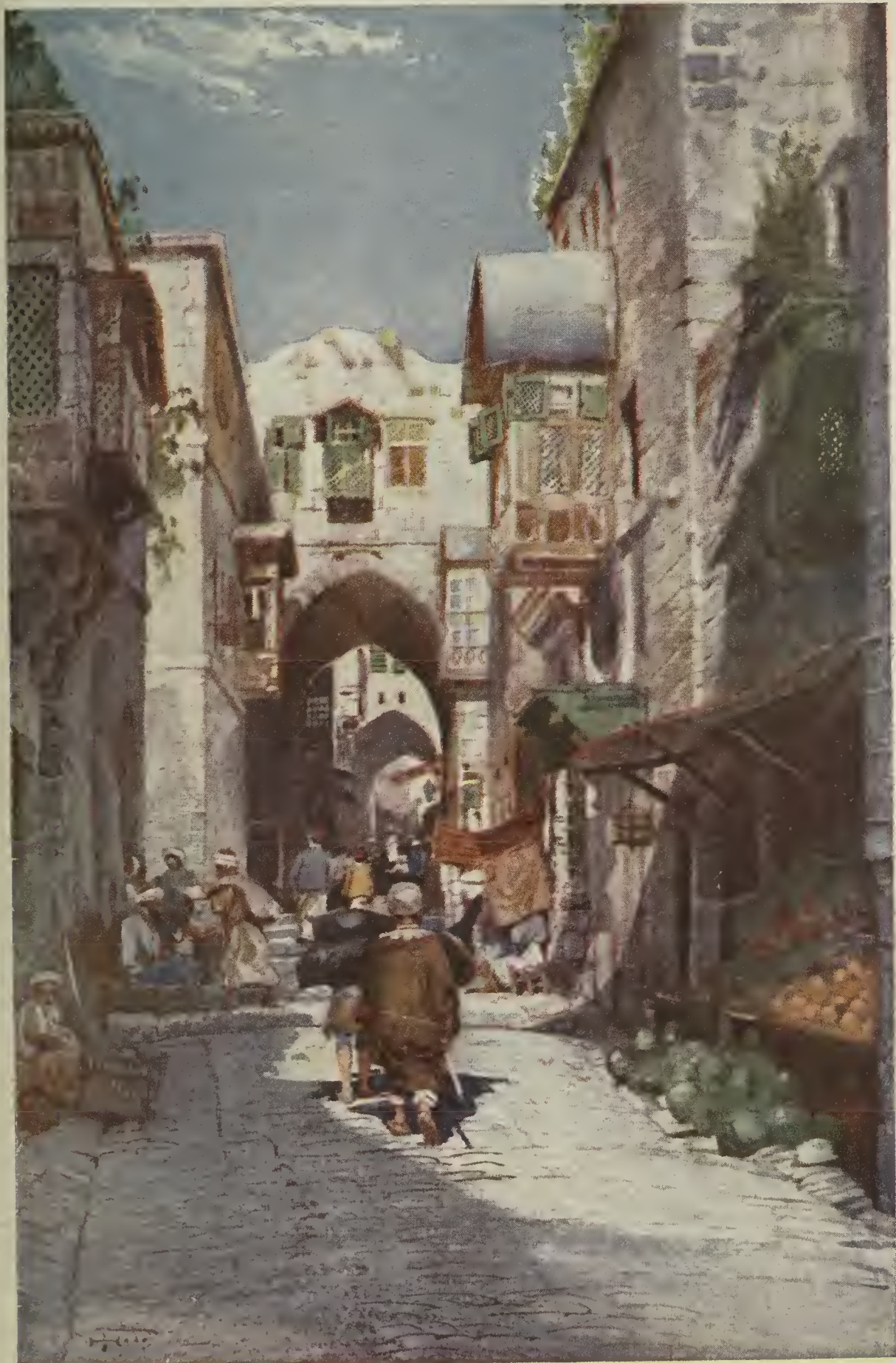
A Street in Jerusalem.